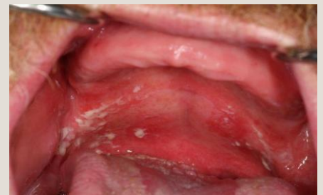
Oral Yeast Infection